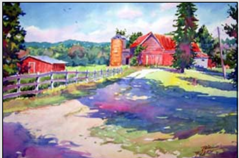
Old Farm Road (Phil Fisher)