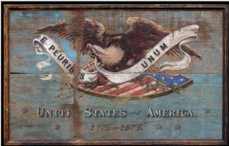
Centennial Eagle & Shield