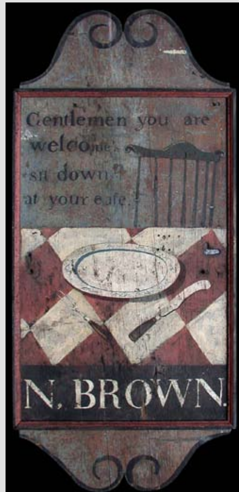
N. Brown Menu Board