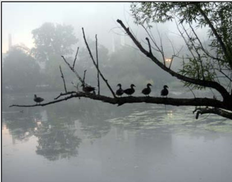
North Pond Fog (Ilivia Yudkin)