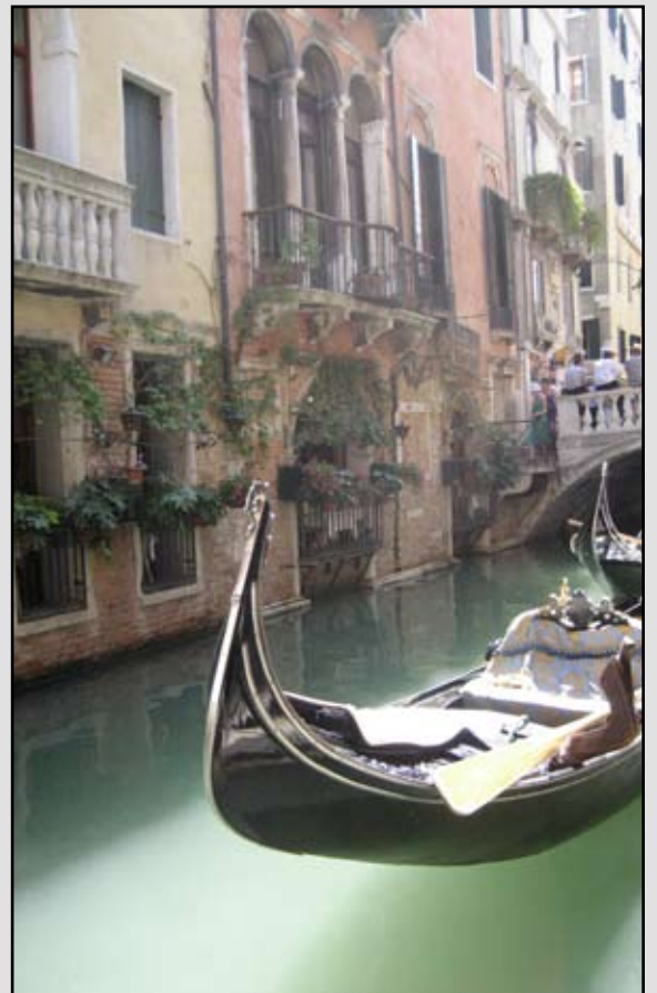
Alley, Venice