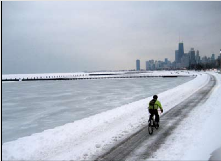
Bike Ice Dusk (Ilivia Yudkin)